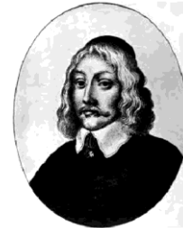
Philip, Lord Wharton 1613 - 1696

Providing Bibles for children and young people Please note: under the terms of the charity this can only be in the United Kingdom and for specific, individual children