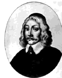
Philip, Lord Wharton 1613 - 1696

Providing Bibles for children and young people Please note: under the terms of the charity this can only be in the United Kingdom and for specific, individual children